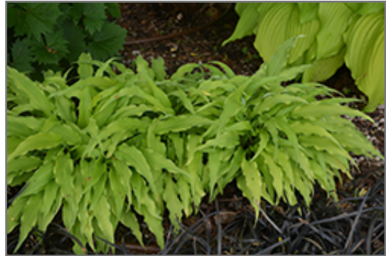
Curly Fries Hosta

Curly Fries Hosta will grow to be only 6 inches tall at maturity extending to 16 inches tall with the flowers, with a spread of 16 inches. When grown in masses or used as a bedding plant, individual plants should be spaced approximately 12 inches apart. Its foliage tends to remain low and dense right to the ground. It grows at a slow rate, and under ideal conditions can be expected to live for approximately 10 years. As an herbaceous perennial, this plant will usually die back to the crown each winter, and will regrow from the base each spring. Be careful not to disturb the crown in late winter when it may not be readily seen!