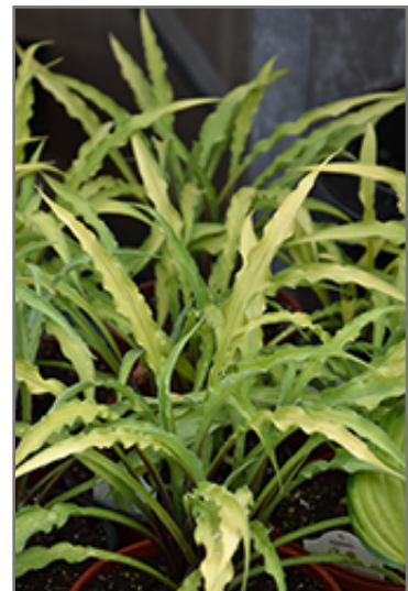
Curly Fries Hosta foliage