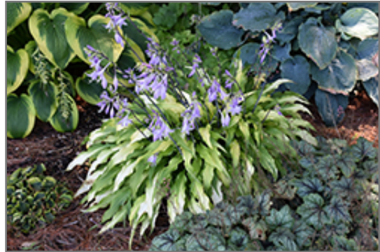
Curly Fries Hosta in bloom