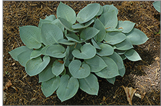
Blue Jay Hosta