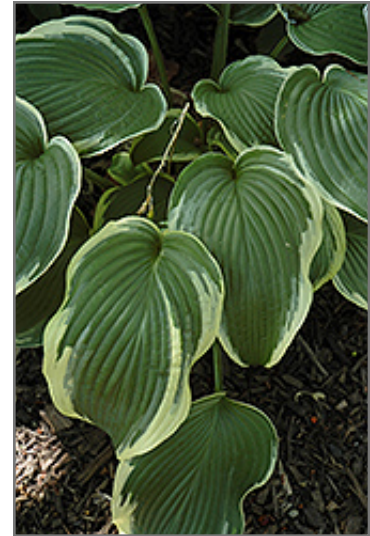
Amazing Grace Hosta foliage