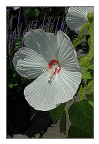
Pinot Grigio Hibiscus flowers

Showy, large, ruffled white flowers with a flush of pink and a purplish-red eye; the large flowers really make a bold statement on this plant that's under 3 feet tall; attractive, large, medium green leaves; do not allow to dry to wilting point