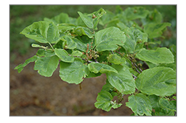
Green Thumb Witchhazel foliage