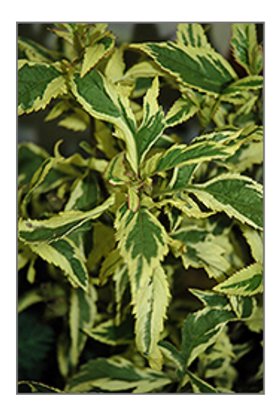
Capri Variegated Joe Pye Weed foliage