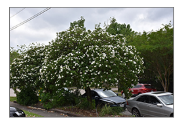
Texas Wild Olive in bloom