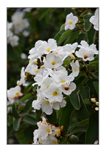
Texas Wild Olive flowers

Texas Wild Olive is a multi-stemmed evergreen tree with an upright spreading habit of growth. Its average texture blends into the landscape, but can be balanced by one or two finer or coarser trees or shrubs for an effective composition.