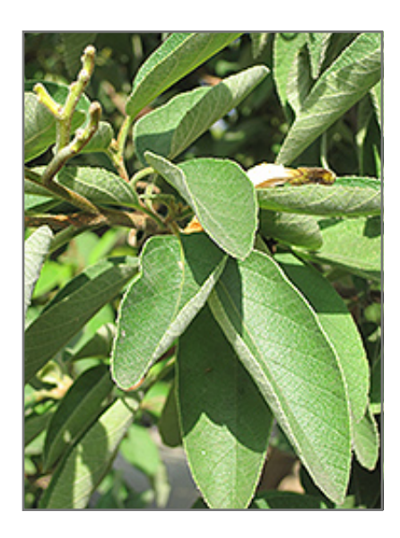
Texas Wild Olive foliage

Texas Wild Olive will grow to be about 20 feet tall at maturity, with a spread of 20 feet. It has a low canopy with a typical clearance of 1 foot from the ground, and is suitable for planting under power lines. It grows at a slow rate, and under ideal conditions can be expected to live for 50 years or more.