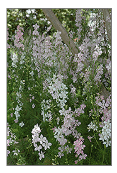
Giant Larkspur in bloom

This naturalized variety likes even moisture in soil that is well drained; impressive spikes of rose or white flowers appear in the summer; lovely when massed along borders