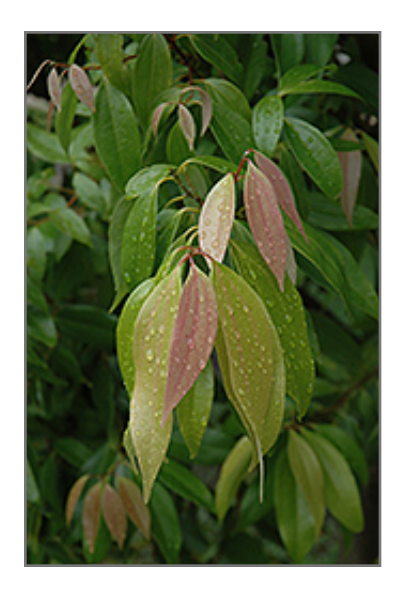
Ceylon Cinnamon foliage