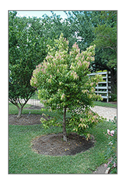
Ceylon Cinnamon

Ceylon Cinnamon is an evergreen tree with an upright spreading habit of growth. Its average texture blends into the landscape, but can be balanced by one or two finer or coarser trees or shrubs for an effective composition.