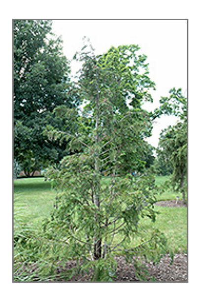
Sullivan Falsecypress

Sullivan Falsecypress will grow to be about 40 feet tall at maturity, with a spread of 30 feet. It has a low canopy with a typical clearance of 3 feet from the ground, and should not be planted underneath power lines. It grows at a medium rate, and under ideal conditions can be expected to live for 70 years or more.