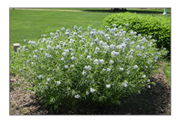
Halfway To Arkansas Blue Star in bloom

Halfway To Arkansas Blue Star is recommended for the following landscape applications;