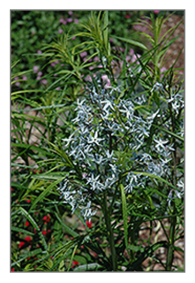
Halfway To Arkansas Blue Star flowers

This is a relatively low maintenance plant, and should be cut back in late fall in preparation for winter. Deer don't particularly care for this plant and will usually leave it alone in favor of tastier treats. It has no significant negative characteristics.