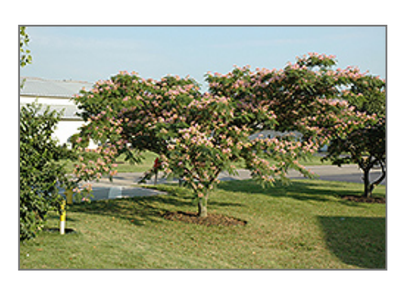
Rosea Mimosa