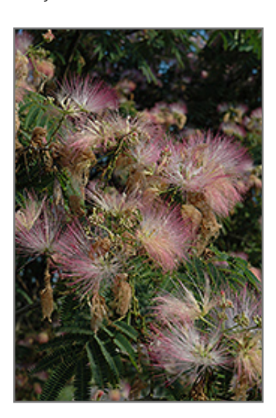
Rosea Mimosa flowers