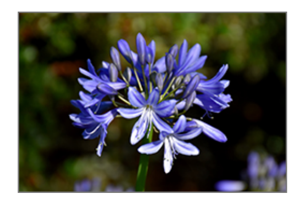
Midnight Blue Agapanthus flowers