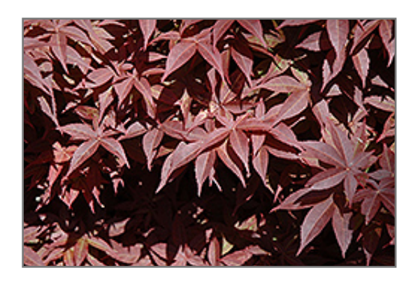
Rhode Island Red Japanese Maple foliage