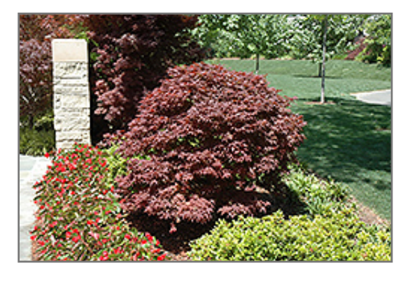
Rhode Island Red Japanese Maple

Rhode Island Red Japanese Maple is primarily valued in the landscape or garden for its ornamental globe-shaped form. It features subtle corymbs of red flowers rising above the foliage in mid spring before the leaves. It has attractive burgundy deciduous foliage which emerges cherry red in spring. The lobed palmate leaves are highly ornamental and turn outstanding shades of orange and red in the fall. The rough gray bark and red branches add an interesting dimension to the landscape.