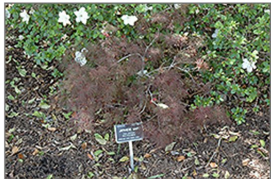
Red Feathers Japanese Maple