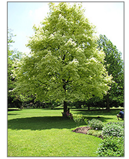
Harlequin Norway Maple

Harlequin Norway Maple is recommended for the following landscape applications;