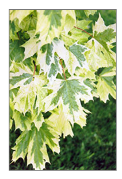
Harlequin Norway Maple foliage