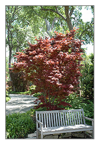
Pixie Japanese Maple

Pixie Japanese Maple is recommended for the following landscape applications;