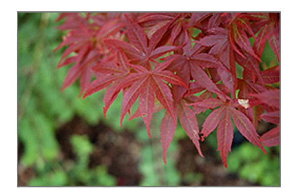
Pixie Japanese Maple foliage