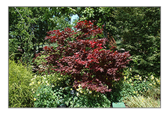
Okagami Japanese Maple