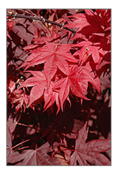
Okagami Japanese Maple foliage

Okagami Japanese Maple is recommended for the following landscape applications;