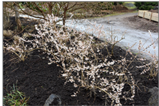
White Forsythia in bloom