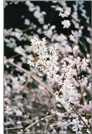
White Forsythia flowers