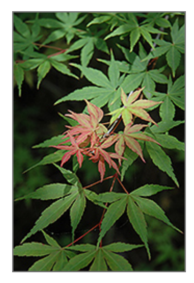
lijima Sunago Japanese Maple foliage

lijima Sunago Japanese Maple is recommended for the following landscape applications;