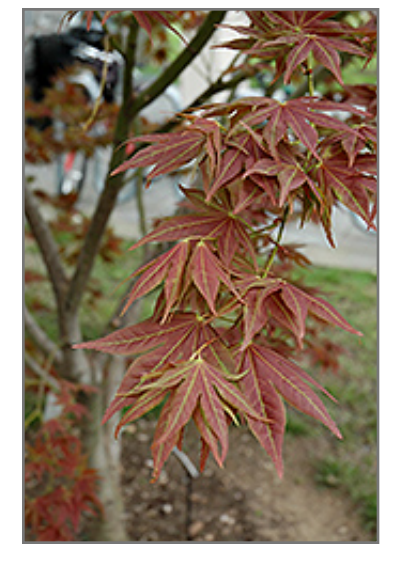
lijima Sunago Japanese Maple foliage

This tree does best in full sun to partial shade. You may want to keep it away from hot, dry locations that receive direct afternoon sun or which get reflected sunlight, such as against the south side of a white wall. It prefers to grow in average to moist conditions, and shouldn't be allowed to dry out. It is not particular as to soil pH, but grows best in rich soils. It is somewhat tolerant of urban pollution, and will benefit from being planted in a relatively sheltered location. Consider applying a thick mulch around the root zone in winter to protect it in exposed locations or colder microclimates. This is a selected variety of a species not originally from North America.