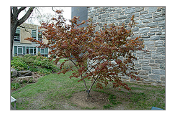
lijima Sunago Japanese Maple