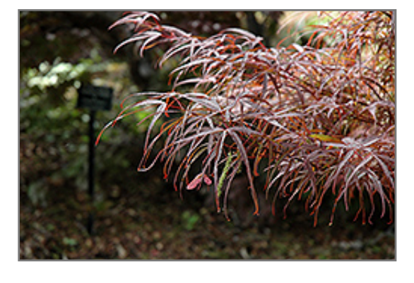
Hubb's Red Willow Japanese Maple foliage

Hubb's Red Willow Japanese Maple is a dense multi-stemmed deciduous tree with an upright spreading habit of growth. It lends an extremely fine and delicate texture to the landscape composition which can make it a great accent feature on this basis alone.