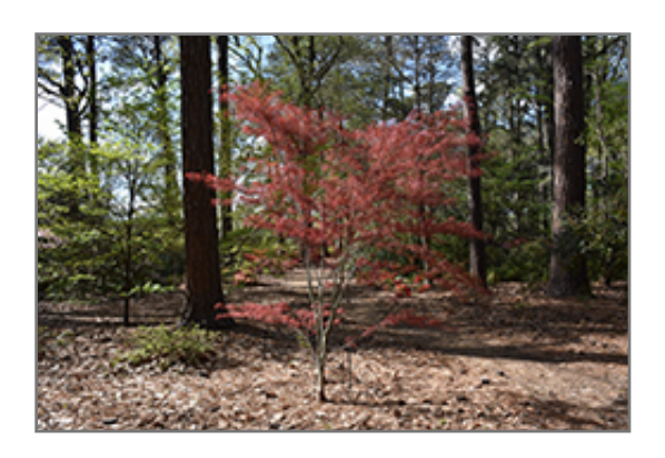
Hubb's Red Willow Japanese Maple

This is a relatively low maintenance tree, and should only be pruned in summer after the leaves have fully developed, as it may 'bleed' sap if pruned in late winter or early spring. It has no significant negative characteristics.