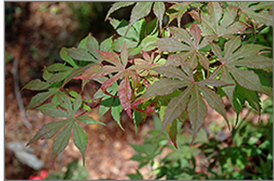
Grandma Ghost Japanese Maple foliage

Grandma Ghost Japanese Maple is recommended for the following landscape applications;