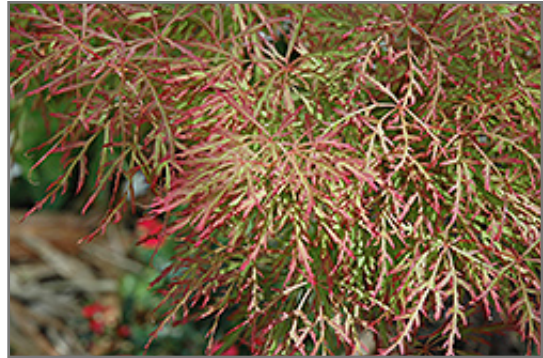
Chantilly Lace Japanese Maple foliage

Chantilly Lace Japanese Maple is recommended for the following landscape applications;