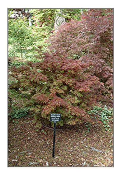
Brandt's Dwarf Japanese Maple

Brandt's Dwarf Japanese Maple is primarily valued in the landscape or garden for its ornamental upright and spreading habit of growth. It has attractive red-variegated green foliage which emerges dark red in spring. The lobed palmate leaves are highly ornamental and turn an outstanding crimson in the fall.