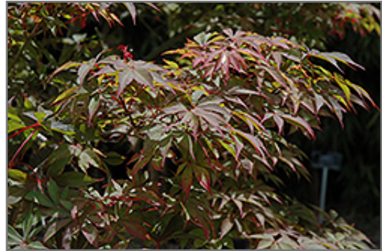
Bonnie Bergman Japanese Maple foliage