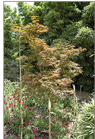
Bonnie Bergman Japanese Maple