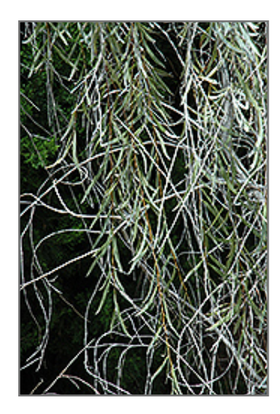
Weeping Myall foliage