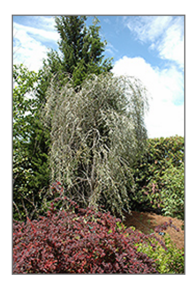
Weeping Myall