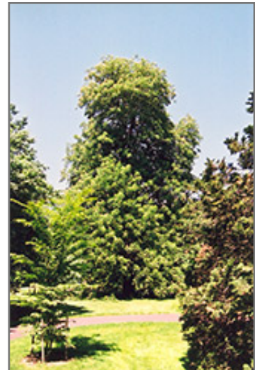
Yellow Buckeye

Yellow Buckeye is recommended for the following landscape applications;