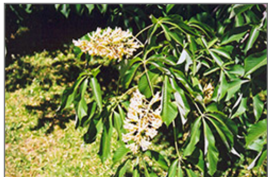
Yellow Buckeye flowers