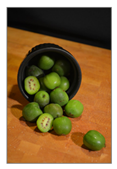
Hardy Kiwi fruit and flesh