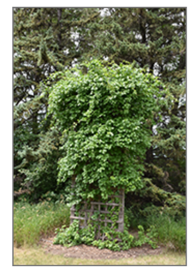
Hardy Kiwi

This woody vine can be integrated into a landscape or flower garden by creative gardeners, but is usually grown in a designated edibles garden. It does best in full sun to partial shade. It prefers to grow in average to moist conditions, and shouldn't be allowed to dry out. It is not particular as to soil type or pH. It is highly tolerant of urban pollution and will even thrive in inner city environments. This species is not originally from North America.