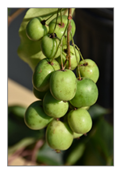
Hardy Kiwi fruit

This is a dense multi-stemmed deciduous woody vine with a spreading, ground-hugging habit of growth. Its relatively coarse texture can be used to stand it apart from other landscape plants with finer foliage. This is a relatively low maintenance plant, and is best pruned in late winter once the threat of extreme cold has passed. It has no significant negative characteristics.