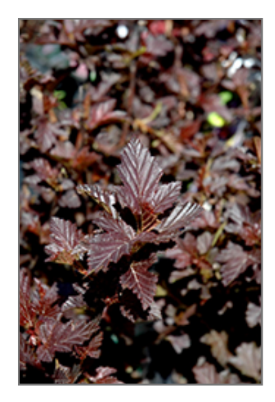
Gumdrop Burgundy Candy Ninebark foliage