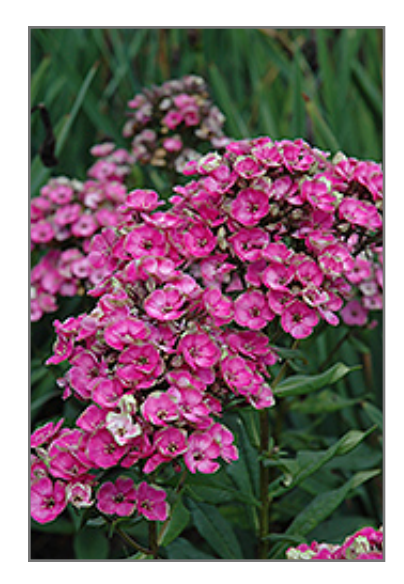
Aureole Garden Phlox flowers

Exceptional early blooms of fragrant fuchsia flowers with chartreuse edges and cream petal reverses, on plants that tend to be bushier; suitable for containers or small perennial borders; good mildew resistance