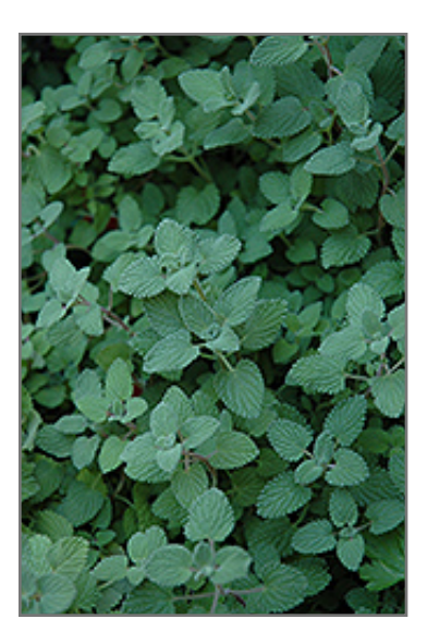
Mussin's Catmint foliage