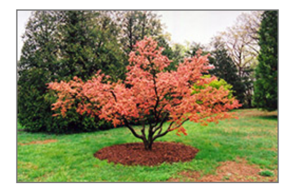
Seigai Japanese Maple