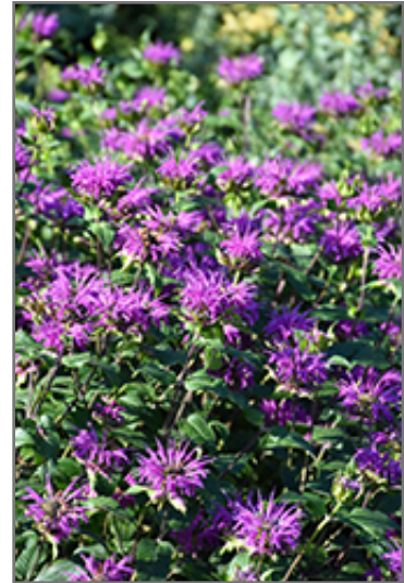
Dark Ponticum Beebalm flowers