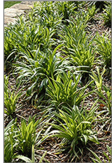
John Burch Lily Turf