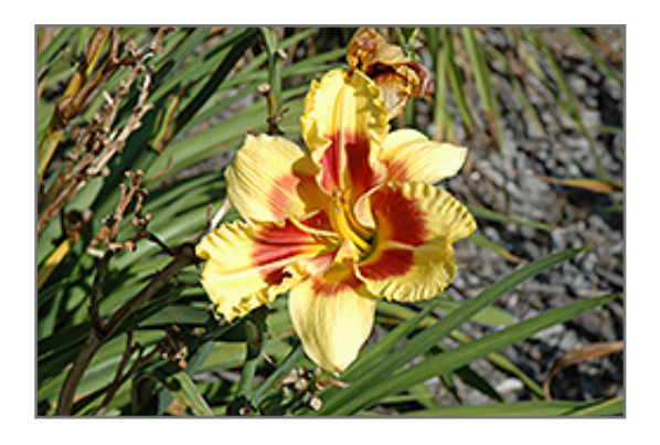
New Clown Face Daylily flowers