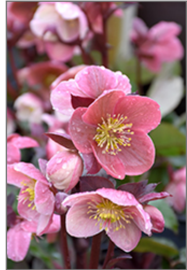
Pink Frost Hellebore flowers

Pink Frost Hellebore is recommended for the following landscape applications;