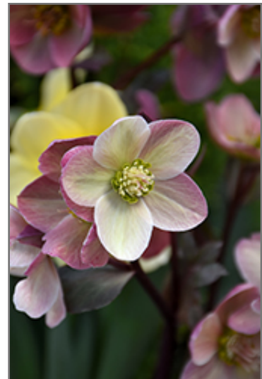
Pink Frost Hellebore flowers