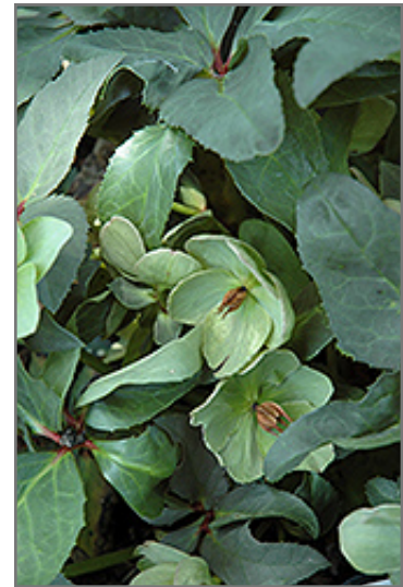
Ice Breaker Pico Hellebore flowers