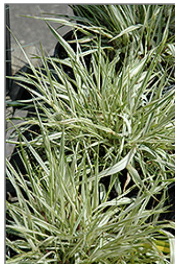
Fubuki Hakone Grass foliage