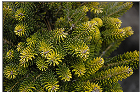
Korean Fir foliage