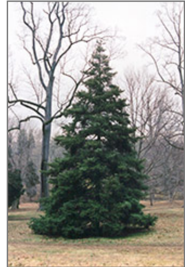
Korean Fir