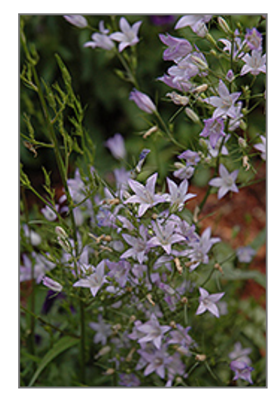
Creeping Bellflower flowers

Pretty lavender-blue bell flowers are set nicely against the medium green foliage; attracts butterflies and bees; extremely vigorous, spreads and self-seeds freely, must be controlled