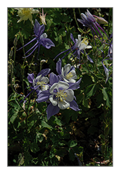
Songbird Blue and White Columbine flowers

Extraordinary light blue and white flowers with darker blue spurs on a compact, many-branched plant; makes a welcome addition to shade and woodland gardens