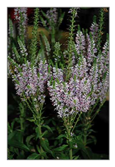
Tricolor Explosion Speedwell flowers

A very dense growing variety, producing multiple large spikes of tri-color flowers of white, lavender and pink; makes an ideal small groundcover, great in rock gardens and along border edges