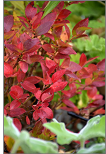
Jelly Bean Blueberry in fall

Jelly Bean Blueberry features dainty clusters of white bell-shaped flowers with shell pink overtones hanging below the branches in mid spring. It has red-variegated green foliage. The glossy oval leaves turn an outstanding red in the fall. It features an abundance of magnificent blue berries in mid summer.