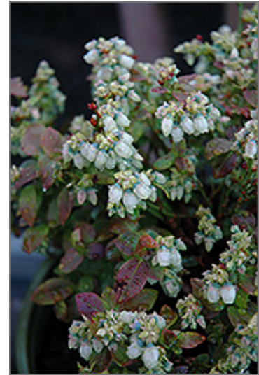
Jelly Bean Blueberry flowers

Jelly Bean Blueberry is a good choice for the edible garden, but it is also well-suited for use in outdoor pots and containers. It can be used either as 'filler' or as a 'thriller' in the 'spiller-thriller-filler' container combination, depending on the height and form of the other plants used in the container planting. It is even sizeable enough that it can be grown alone in a suitable container. Note that when grown in a container, it may not perform exactly as indicated on the tag - this is to be expected. Also note that when growing plants in outdoor containers and baskets, they may require more frequent waterings than they would in the yard or garden. Be aware that in our climate, most plants cannot be expected to survive the winter if left in containers outdoors, and this plant is no exception. Contact our experts for more information on how to protect it over the winter months.