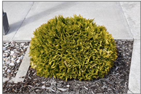
Anna's Magic Ball Arborvitae

Anna's Magic Ball Arborvitae is recommended for the following landscape applications;