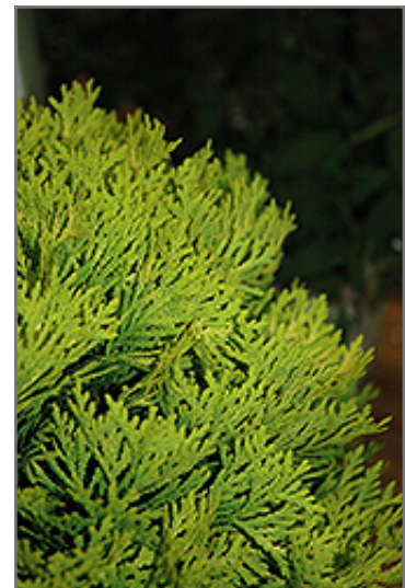
Anna's Magic Ball Arborvitae foliage