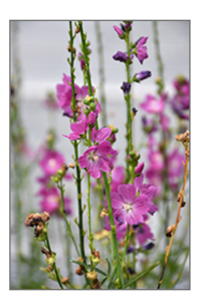
Party Girl Prairie Mallow flowers

A pretty variety presenting tall spikes of brilliant lilac-pink blooms with white centers and purple stripes; an upright perennial great for the middle of a border; cut fading flower spikes to the ground to encourage a second flush of blooms in autumn