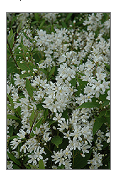
Nikko Deutzia flowers