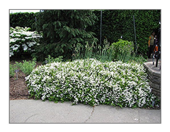
Nikko Deutzia in bloom

Nikko Deutzia is recommended for the following landscape applications;