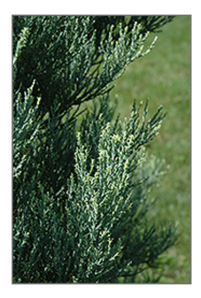
Hazel Smith Giant Sequoia foliage