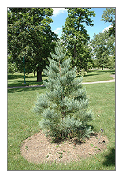
Hazel Smith Giant Sequoia