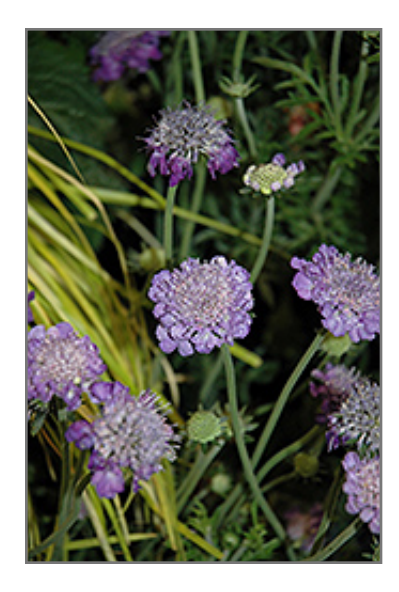
Mariposa Violet Pincushion Flower flowers