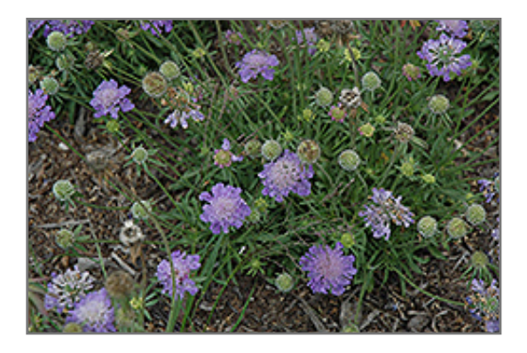
Blue Note Pincushion Flower in bloom