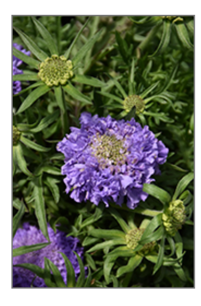
Blue Note Pincushion Flower flowers

This is a relatively low maintenance plant, and should be cut back in late fall in preparation for winter. It is a good choice for attracting bees and butterflies to your yard, but is not particularly attractive to deer who tend to leave it alone in favor of tastier treats. It has no significant negative characteristics.