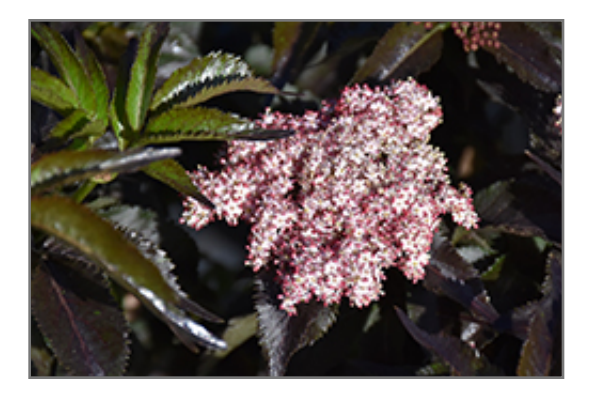
Black Tower Elder flowers

Black Tower Elder will grow to be about 8 feet tall at maturity, with a spread of 4 feet. It has a low canopy with a typical clearance of 1 foot from the ground, and is suitable for planting under power lines. It grows at a fast rate, and under ideal conditions can be expected to live for approximately 30 years.