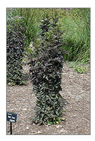
Black Tower Elder