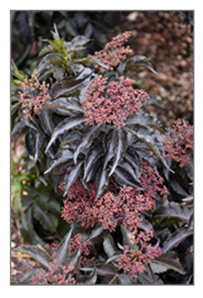
Black Tower Elder flower buds

This is a high maintenance shrub that will require regular care and upkeep, and is best pruned in late winter once the threat of extreme cold has passed. It is a good choice for attracting birds to your yard. Gardeners should be aware of the following characteristic(s) that may warrant special consideration;